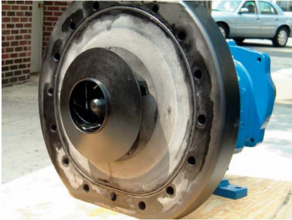
A 4 x 3 – 9 chemical pump with an enclosed impeller instead of an open impeller.