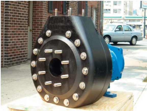
The chemical pump (for use with HCL acid) was performance tested with the open impeller and then again with an enclosed impeller. The results show a substantial improvement in efficiency and an increase in the head-capacity (H-Q) curve. The enclosed impeller would then be trimmed to the original performance specifications.