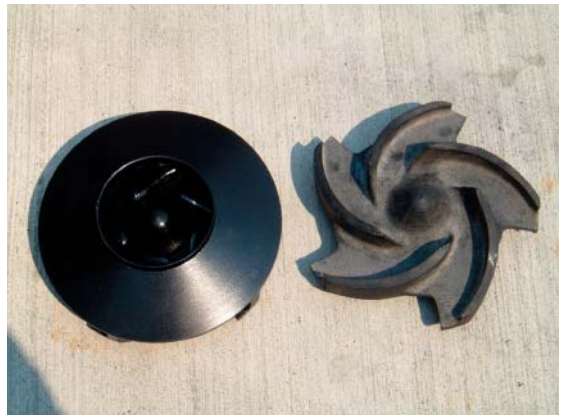
This picture shows a comparison of two impellers—one open-faced and one enclosed. This open-faced impeller (right) was redesigned and converted into an enclosed impeller (left). The result was a substantial increase in the pump performance, efficiency and reliability.