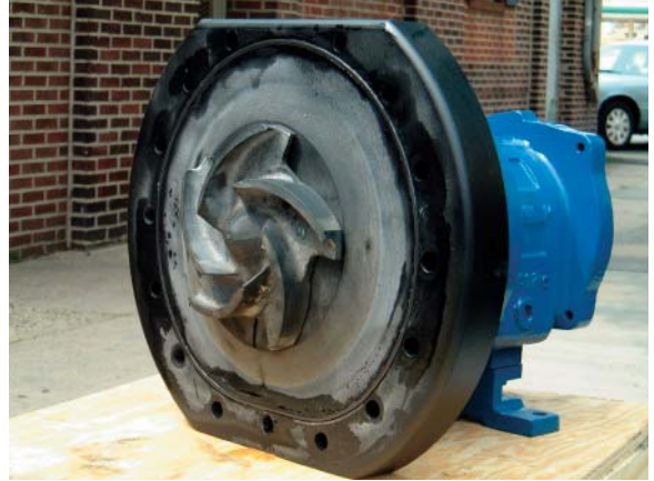
The same 4 x 3 – 9 chemical pump was originally designed with an open impeller.