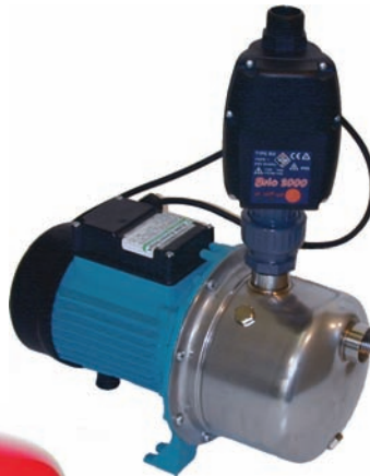
JET 100/E INOX