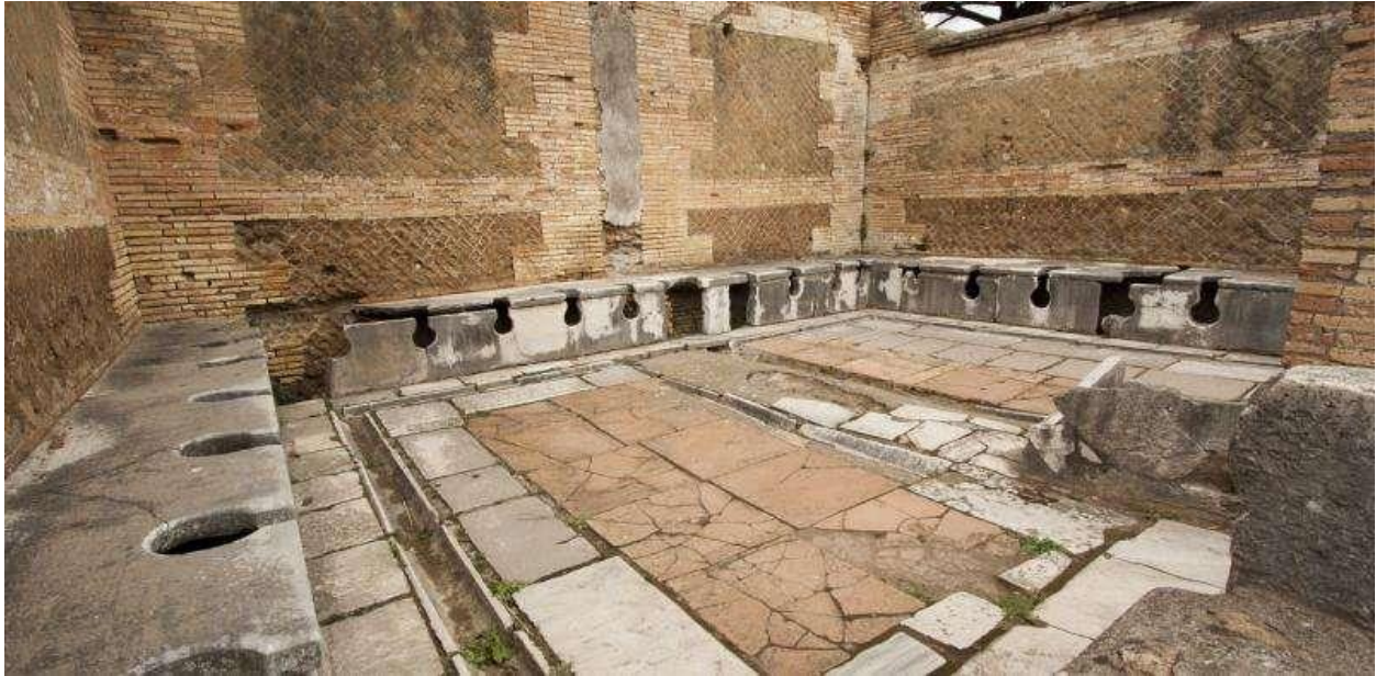
Ruin of a second-century public toilet in Roman Ostia.