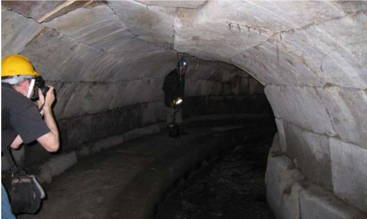
Inside a tunnel of Rome's sewer, the Cloaca Maxima.

In fact, almost every private house in these cities, and many apartment houses in Ostia, had private, usually one-seater, toilets not connected to the main sewer lines.