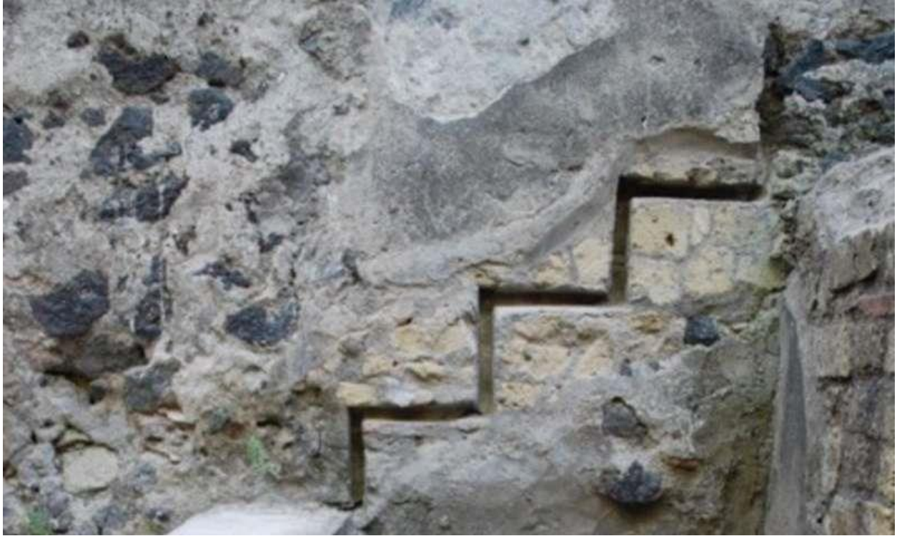
A private toilet under the stairs in Herculaneum's Casa del Gran Portale.

When we look at the evidence for Roman sanitary practices, both textual and archaeological, it becomes obvious that their perspectives were quite different from ours. Gaining a better understanding of Roman life on their streets, in their public spaces, and in their private dwellings shows us that they were in the early stages of developing systems that we've adopted – with upgrades – for our own problems with sanitation and clean water today.